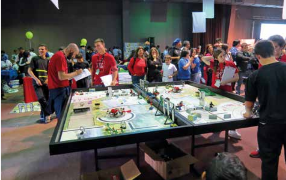
Figure 1. Robotics, Plan Ceibal, Uruguay, Nov. 2016.

Perhaps one of the most remarkable recent variations on robotic turtles is the “tortuga Butiá” made in 2012. It is essentially a “moving laptop”, a laptop mounted on wheels, a clever invention of the School of Engineering in Uruguay that is easy to build and uses free software (Turtle Art) and free hardware. 3 Therefore, every device of the laptop, videos, photos, sounds, and a multiplicity of sensors, is already incorporated in the (laptop) robot and may be used freely without extra costs.